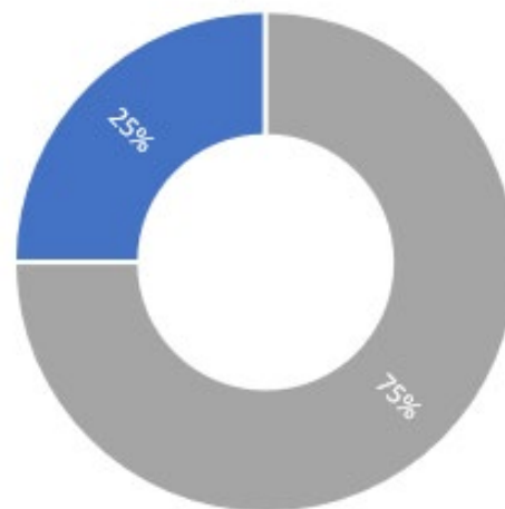
Gender Diversity - Senior Executives