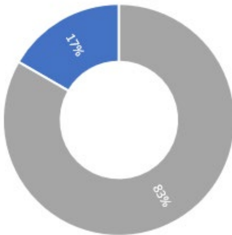
Gender Diversity - Board

www.ambertech.com.au/company/corporate-governance